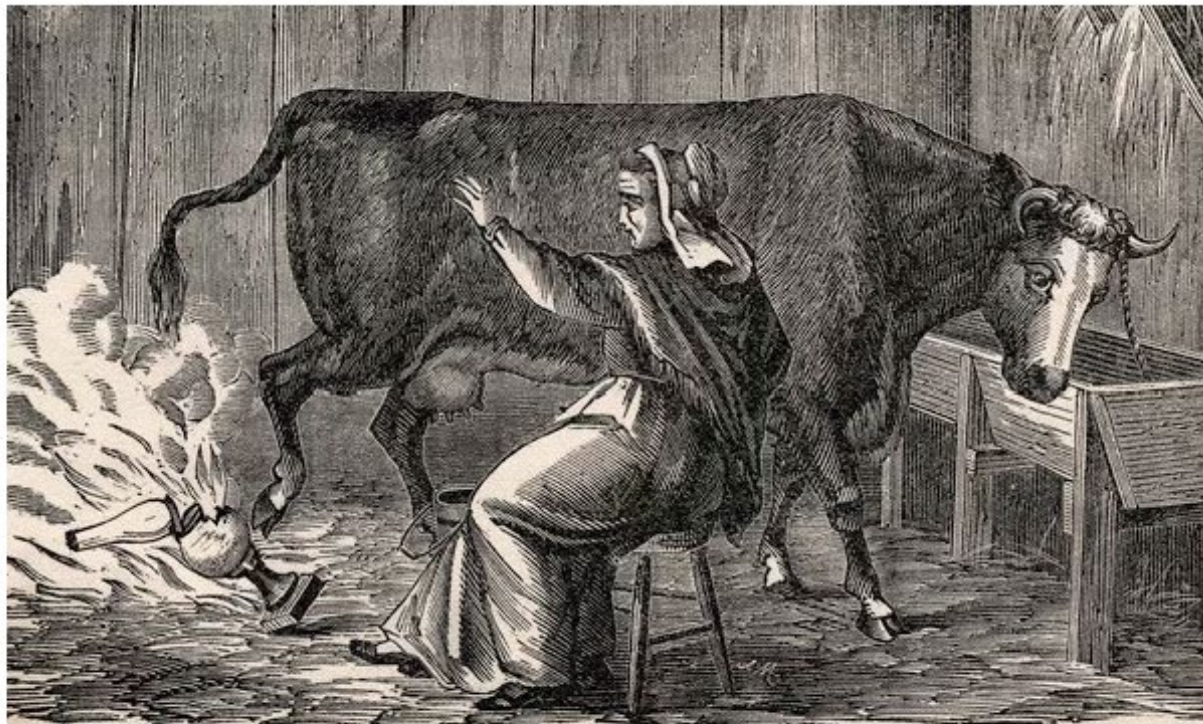
An illustration from Harper's 1871 magazine depicting Mrs. O'Leary with her cow.